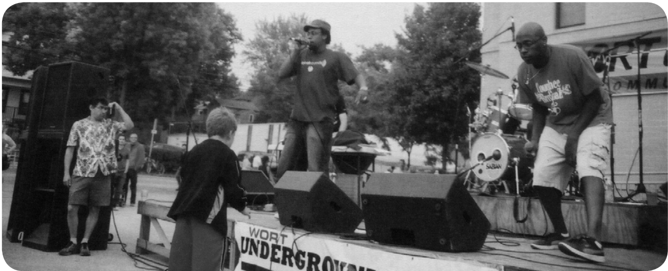
▲ Warmer days: dumate rocks the WORT Underground Stage at the Willy St. Fair last September.