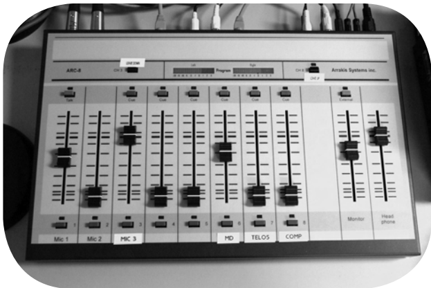
▲ One of our new Arrakis mini broadcast mixing boards.

The newsroom makeover includes a refurbished studio space. Formerly known as "Das Boot" because of its cramped quarters, the space is now outfitted with a new broadcast mixing board. The new board's design makes the reporter's job less complicated and opens